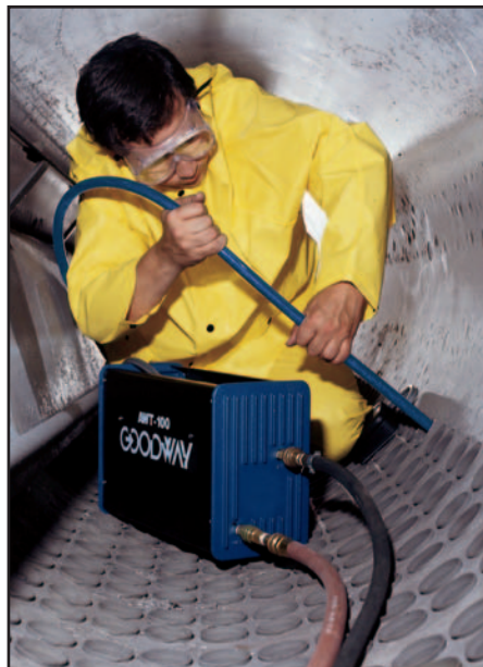
Ideal for Cleaning Watertube Boilers