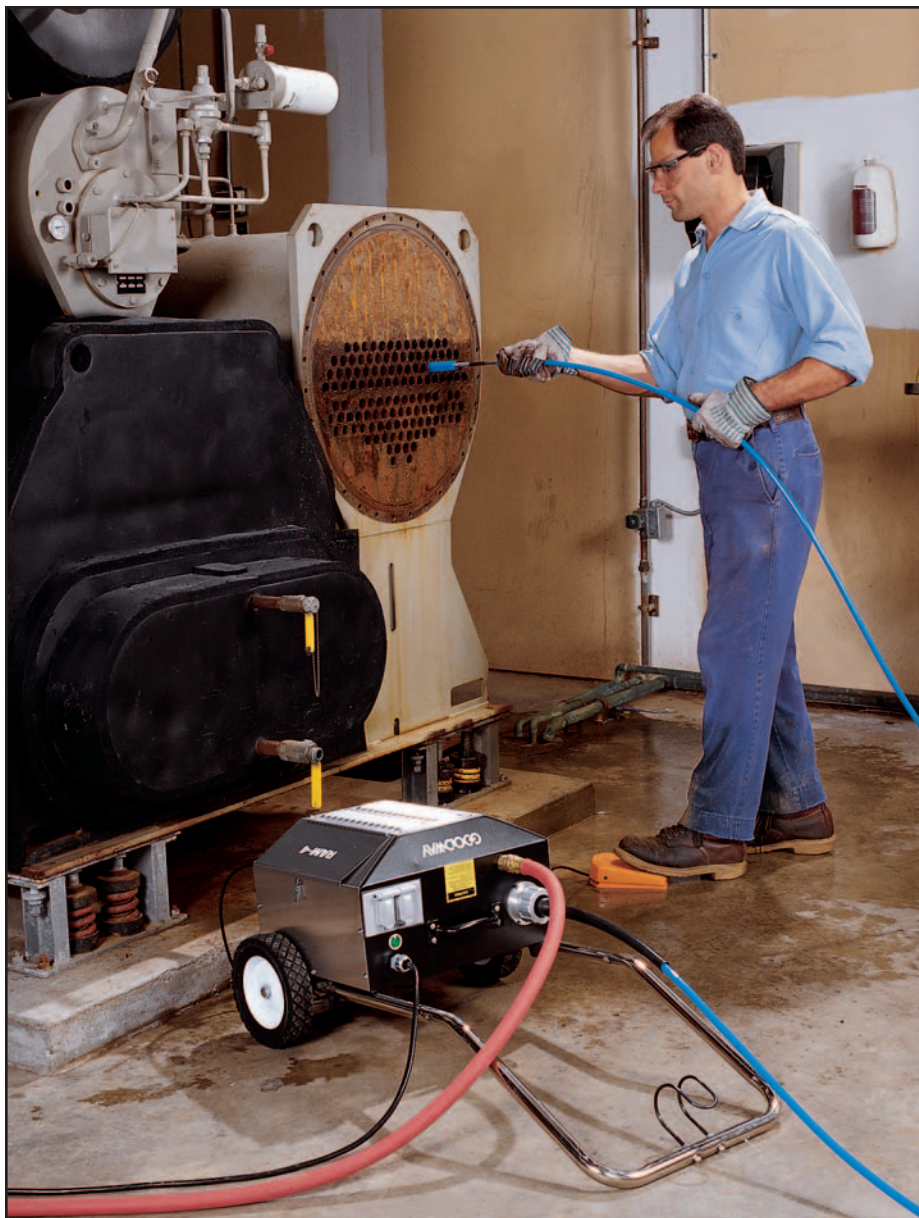
Ideal for Chiller Cleaning Applications