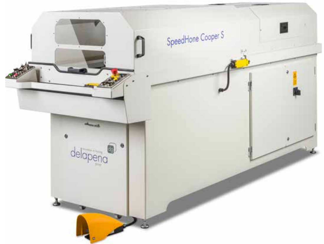
SpeedHone Cooper S

designed for individual customer requirements, offering easy to use operating system and quicker component turn-around